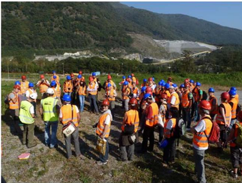
A place where man moves mountains. Excavated granite “gravel powder” is stocked in a mountainous region in Ticino, Switzerland.