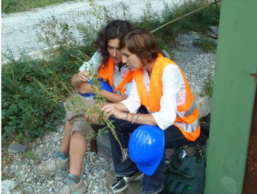
Subject of interest Ambrosia artemisiifolia in the hands of two delegates.