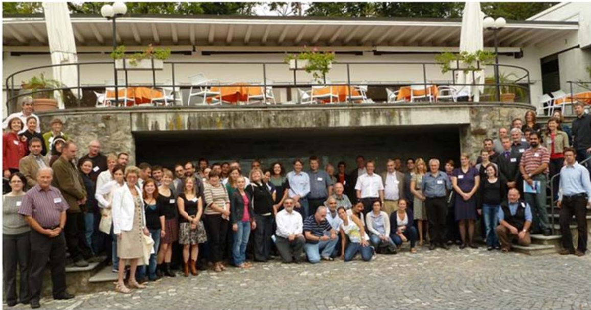
More than 100 participants from 26 countries of all continents !