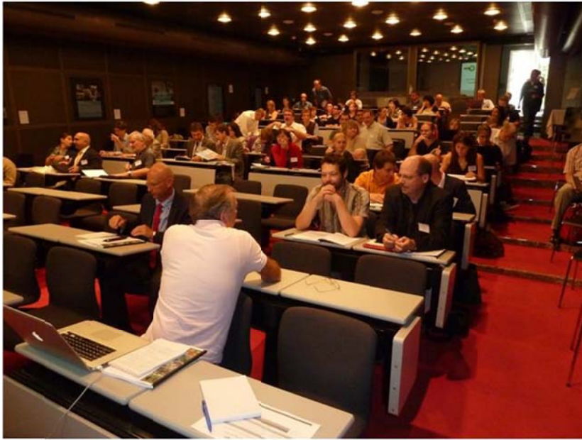
In the plenary hall.