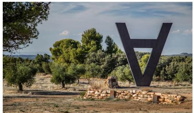
Photo Credits 14. https://www.turismegarrigues.com/es/visitasdeinteres/vinyadels-artistes/