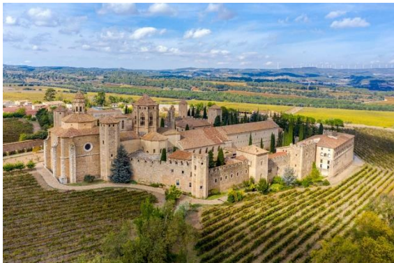
Photo Credits 13. https://saposyprincesas.elmundo.es/actividades-ninos/tarragona/cultura/monumentos/el-monasterio-de-santa-maria-de-poblet

More info: https://whc.unesco.org/en/list/518/ https://www.masblanchijove.com/en/the-vineyard/